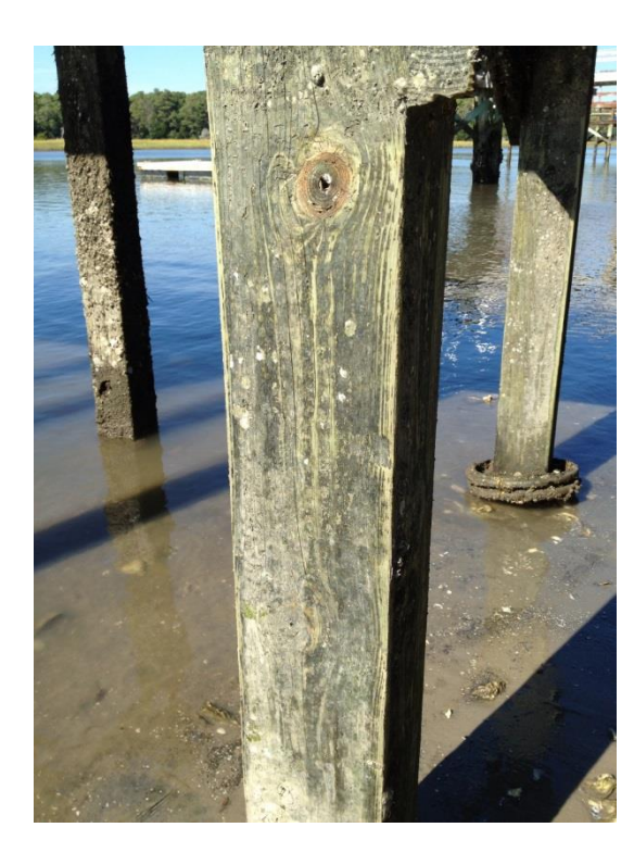
Fig. 3 Organism accumulation on piles after five months equipped with Pile Savers ( A ), or not equipped with Pile Savers ( B ). Frame C depicts a pile (P2A) equipped with a Pile Saver but containing an indentation in which organisms accumulated.